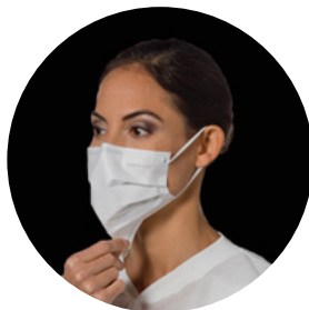
3. Secure chin closure.