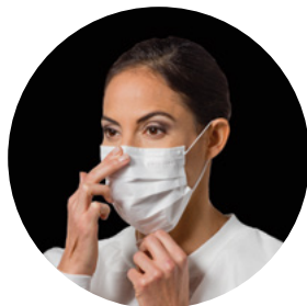
2. Extend mask.