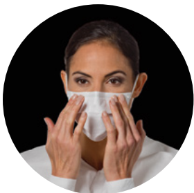
1. Secure top edge.