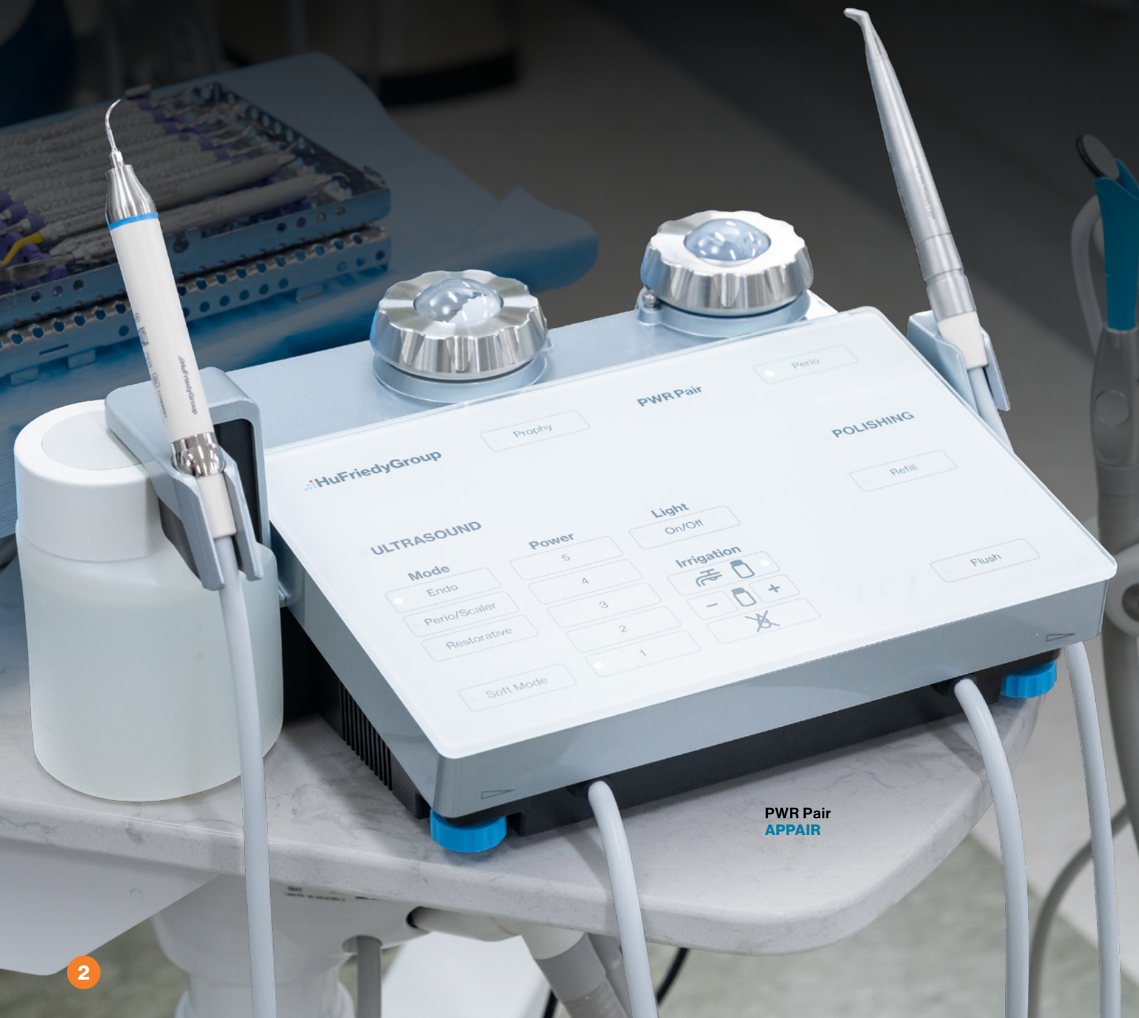
PWR Pair APPAIR

Learn more about PWR Piezo Scaling & Air Polishing at HuFriedyGroup.com/PWR-ON