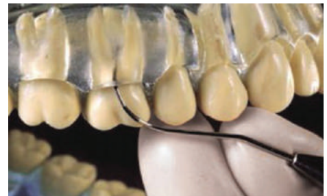
Using a typodont to calibrate intra-office clinicians

and does not measure furcation entrance distance in millimeters but rather by the subjective evaluation of the degree of attachment loss through the furcation.